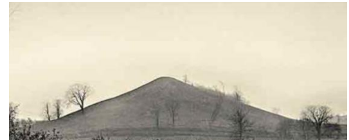
Hill Cumorah 1907